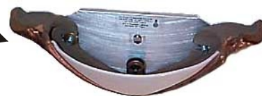
Sconce body attached to canopy with large knurled brass nuts, ready for a bulb.

Please ensure that you do not exceed the rated bulb wattage listed on the sconce and that the bulb does not touch any part of the sconce.