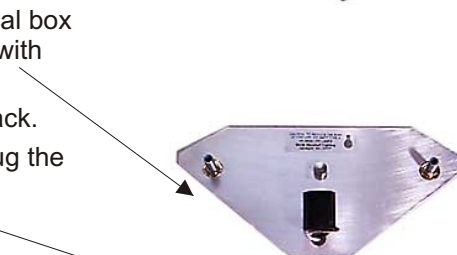
Canopy attached to wall via the central stud with the knurled cap. Ready for sconce body to be placed on the mounting studs.